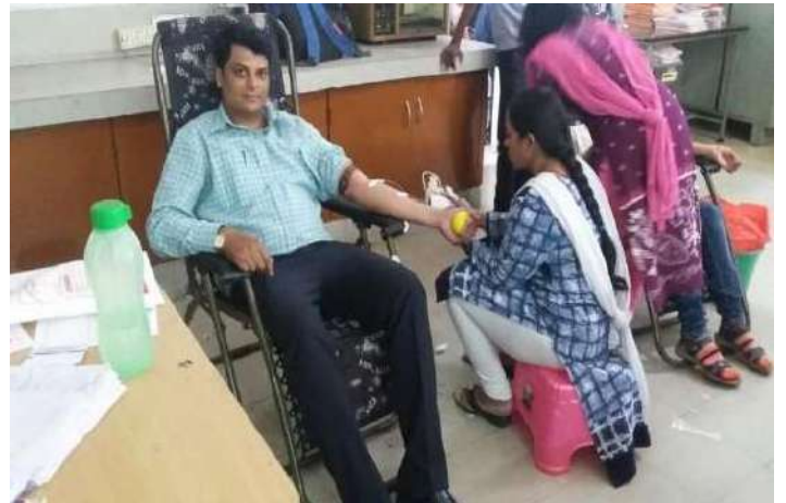
Felicitations of Hon. Chairman at LTJSS and Participation in Blood Donation Camp