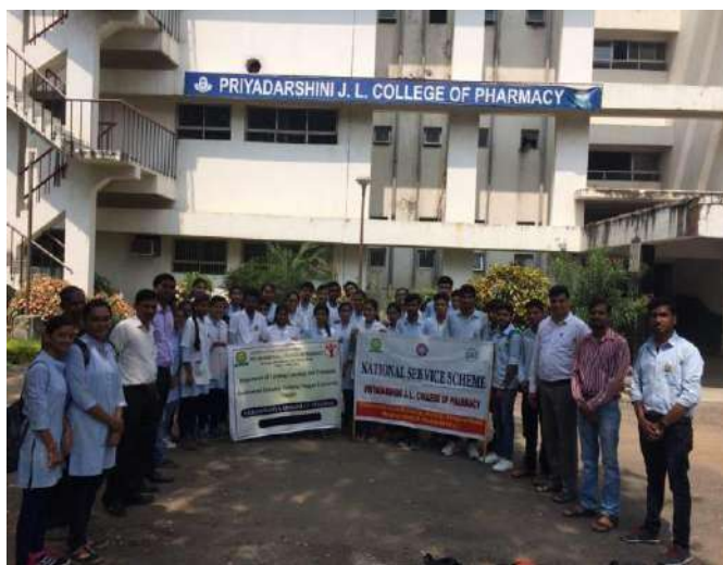
Participation of Students and Faculty members in Swachata Abhiyan