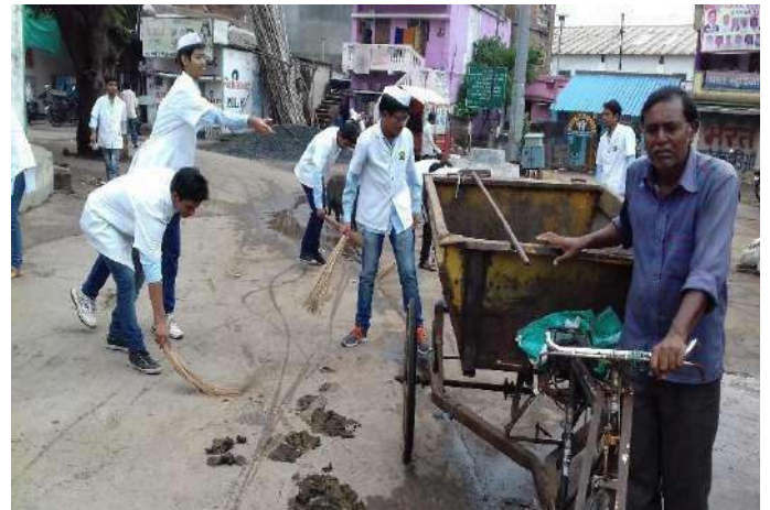
Felicitations of Hon. Chairman at LTJSS and Participation in Shramdan and Gramswachata Abhiyan