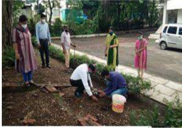
Tree Plantation by students and faculty Members