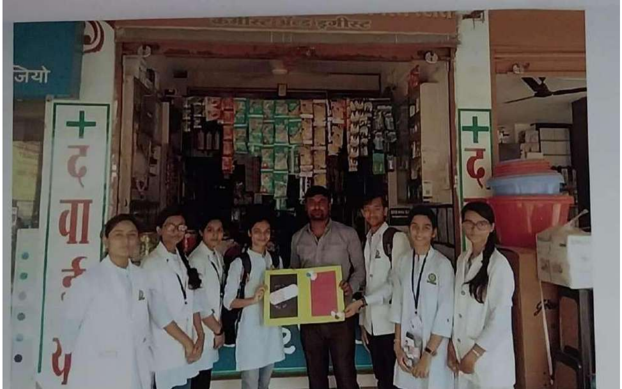
Felicitation of Pharmacists by students of P.J.L.C.P